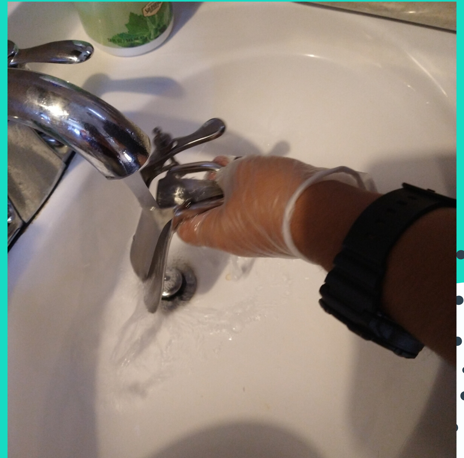
Step 5: Rinse the Instrument