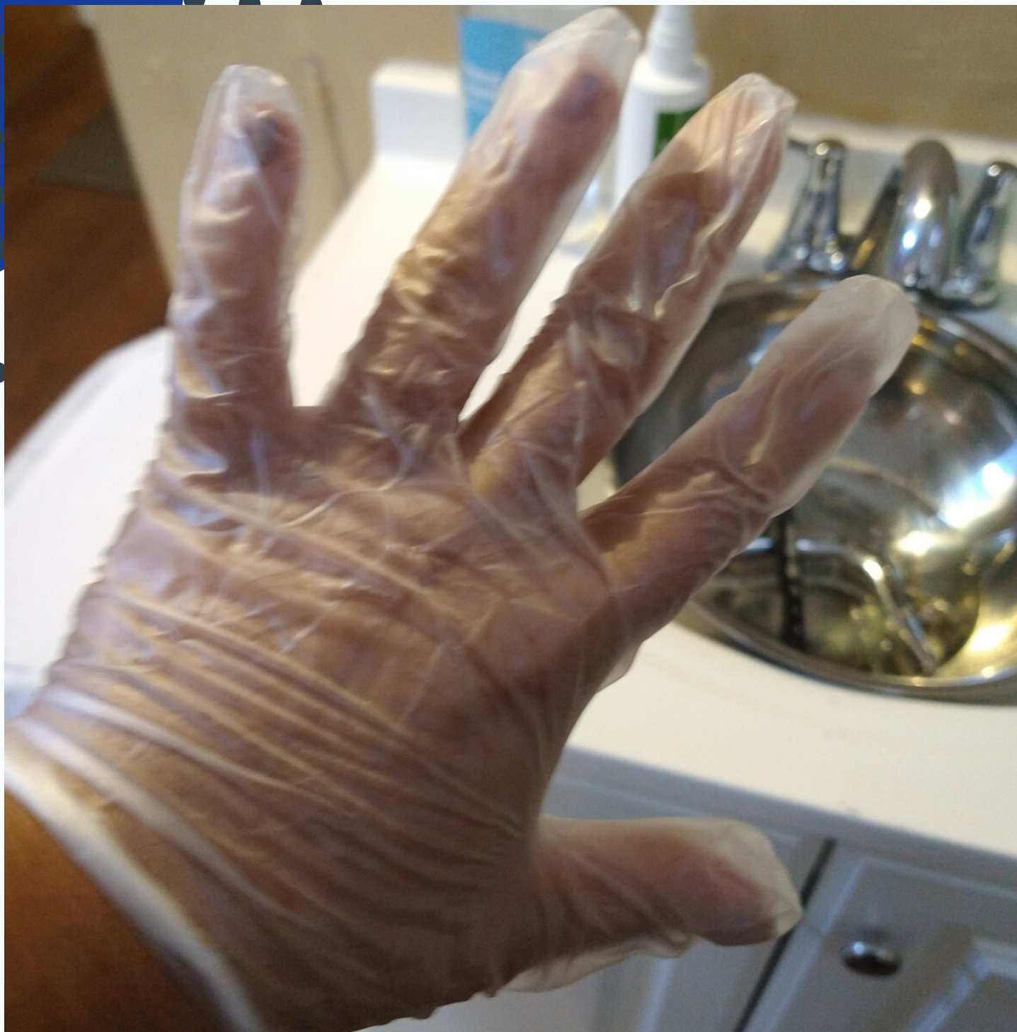
Step 2: Put on Gloves and put on a mask

Step 3: Add the instrument in a bowl and the Cleaner.