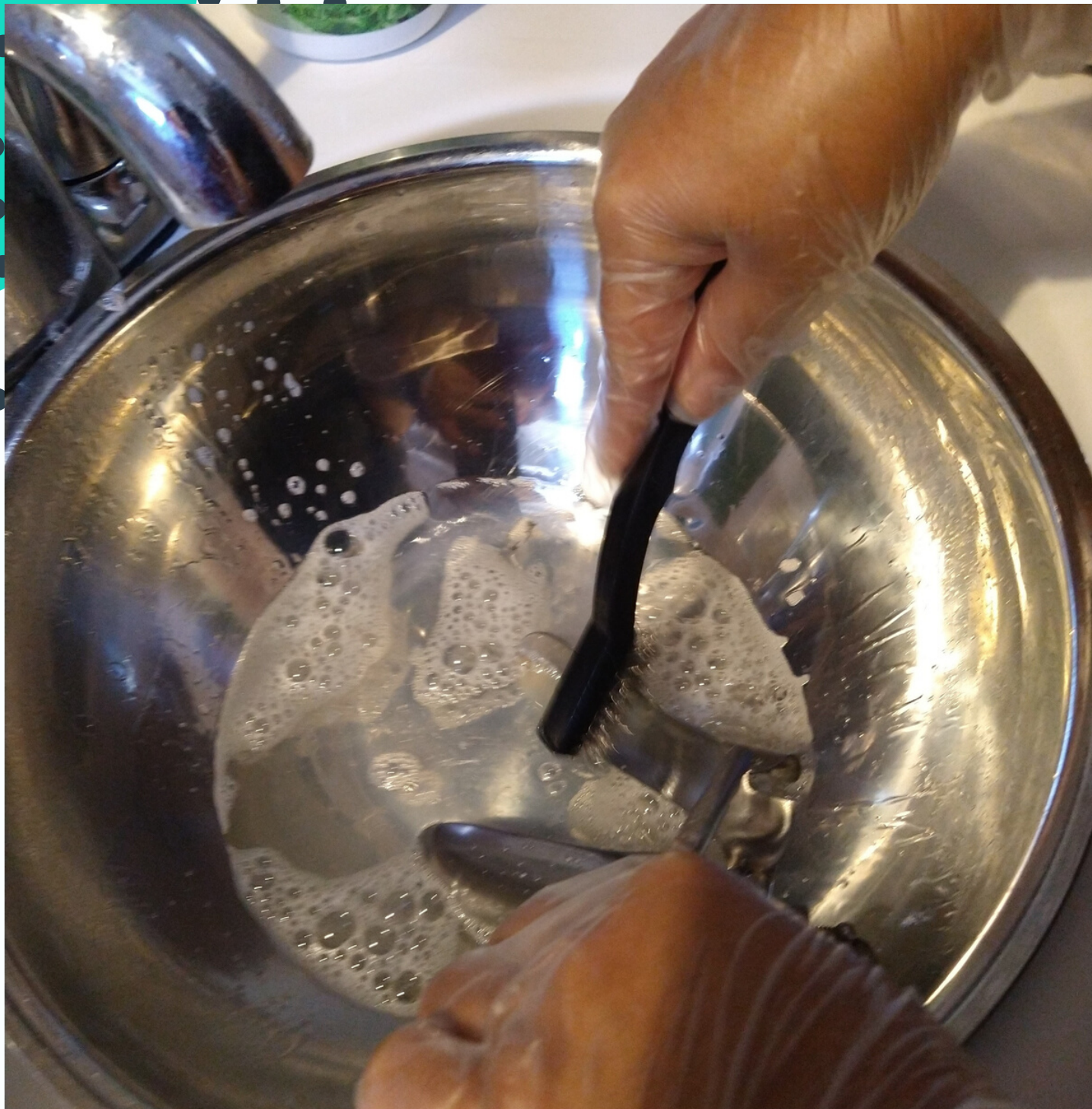
Step 4: Scrub the instrument